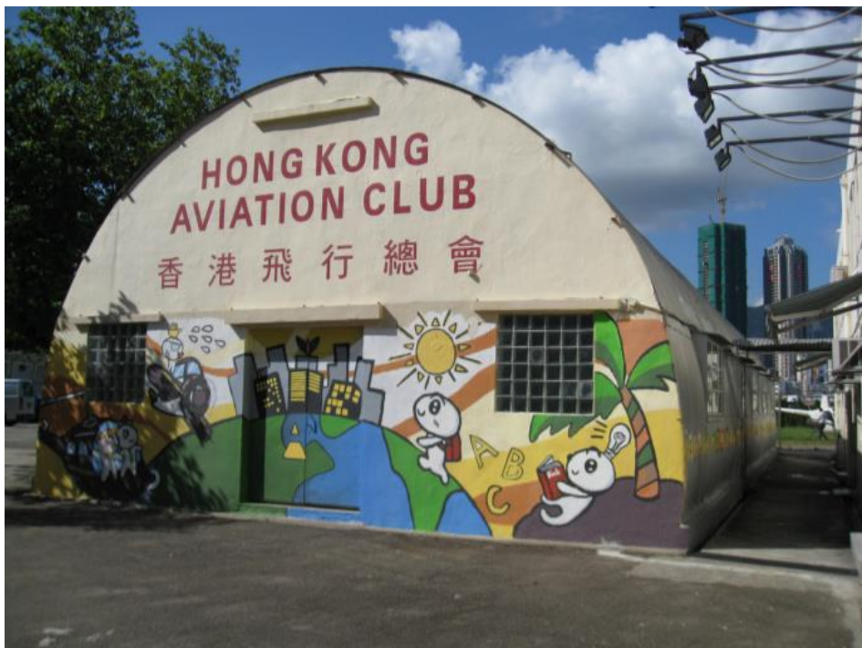
Nissen Hut, Hong Kong Aviation Club